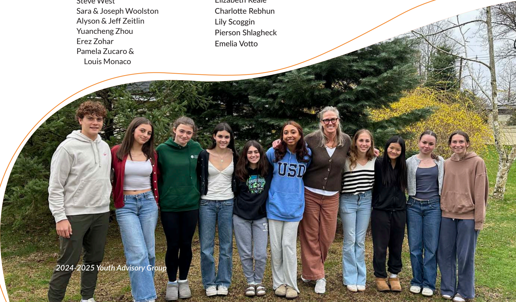
2024-2025 Youth Advisory Group