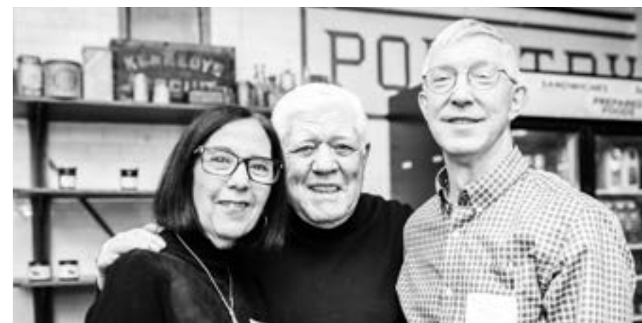
Photos: The TGF community in 2025, coming together to celebrate 50 years of impact and generosity.