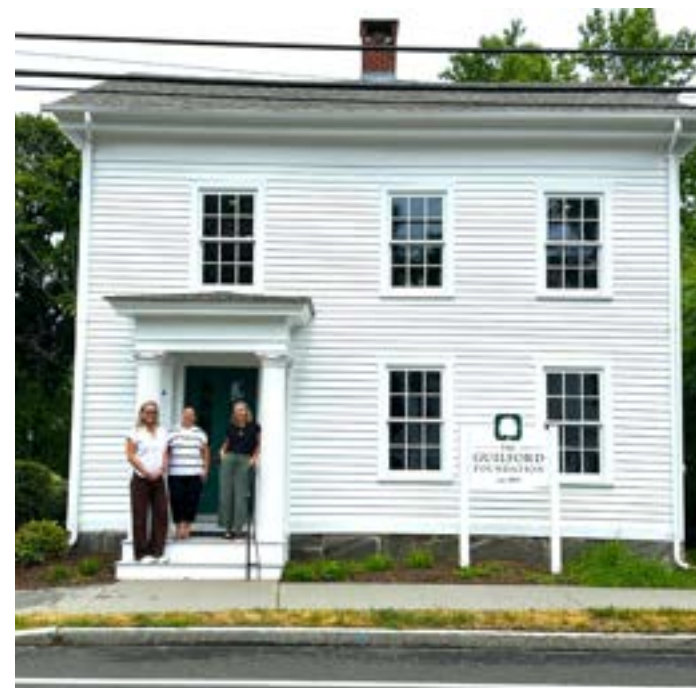
Photo: TGF staff stand in front of the newly renovated office.