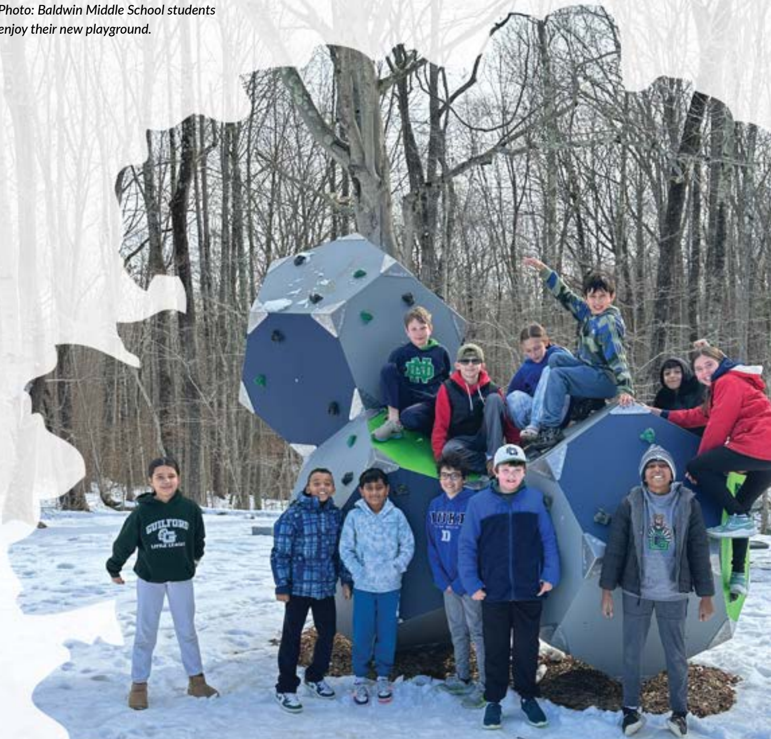
Photo: Baldwin Middle School students enjoy their new playground.