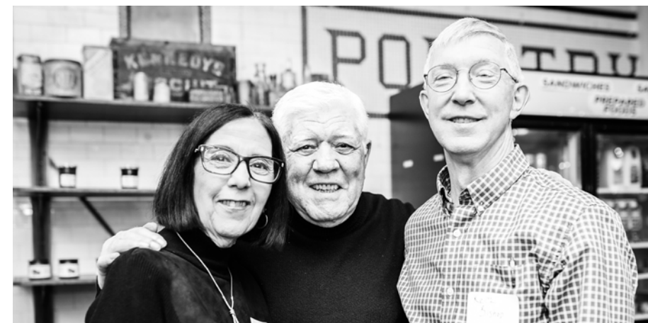
Photos: The TGF community in 2025, coming together to celebrate 50 years of impact and generosity.