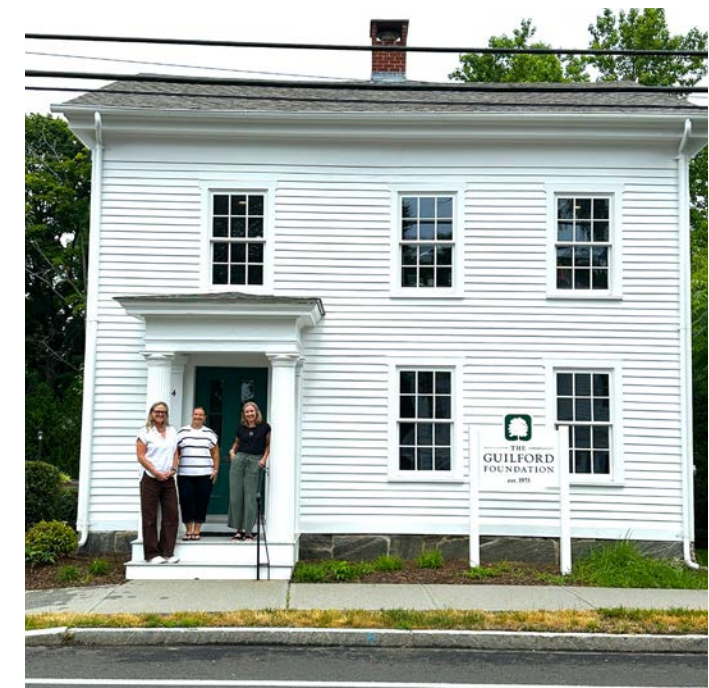
TGF staff stand in front of the newly renovated office.