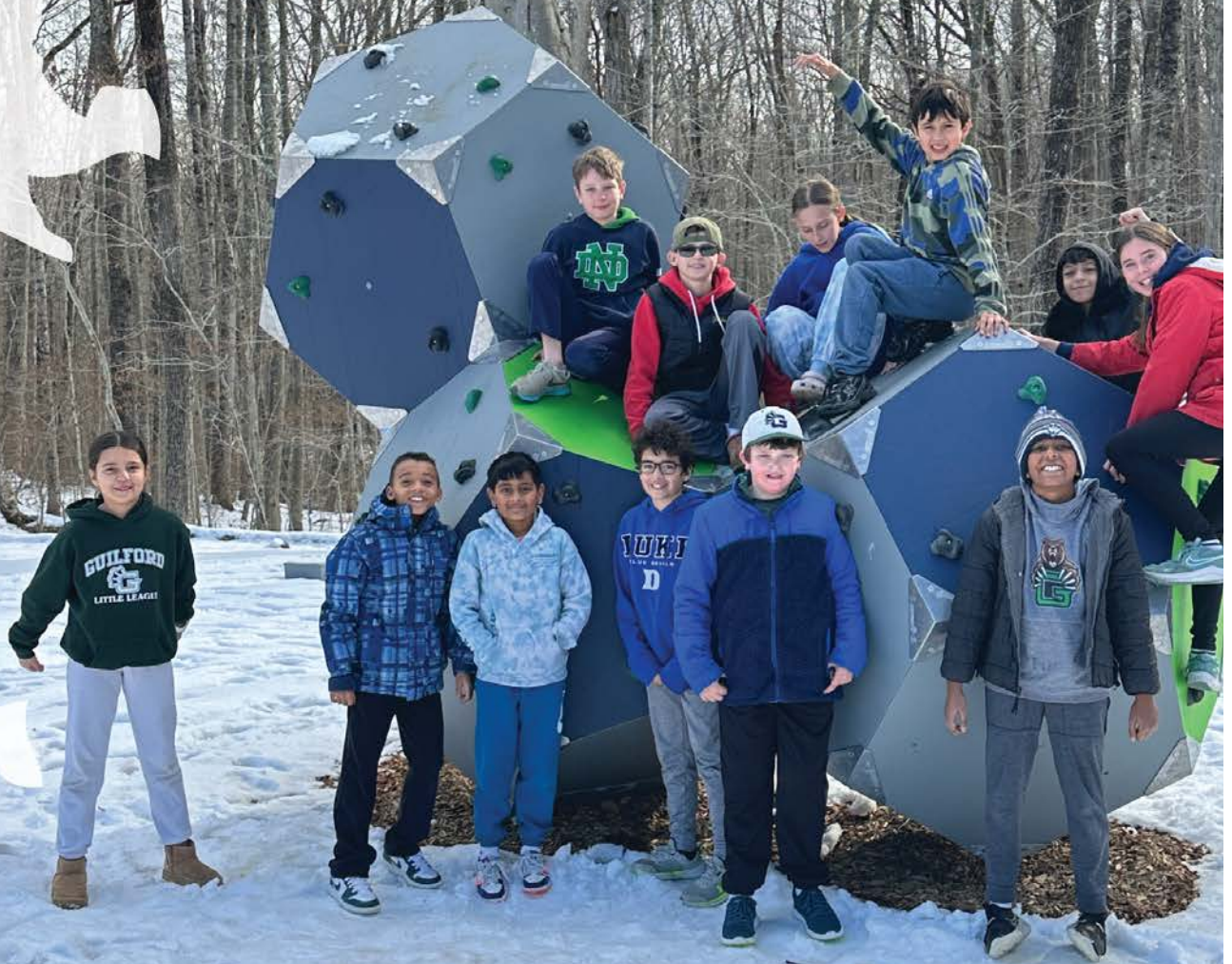
Photo: Baldwin Middle School students enjoy their new playground.